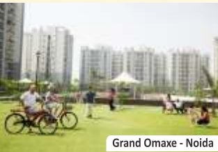
Grand Omaxe - Noida