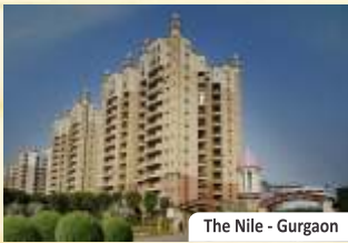
The Nile - Gurgaon