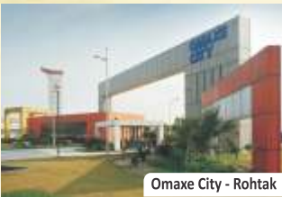
Omaxe City - Rohtak