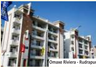
Omaxe Riviera - Rudrapur