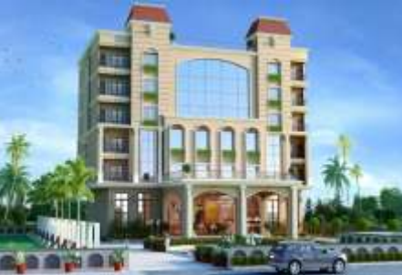
3 Star Hotel - Omaxe 2