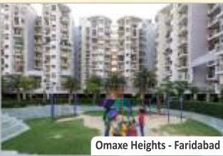
Omaxe Heights - Faridabad