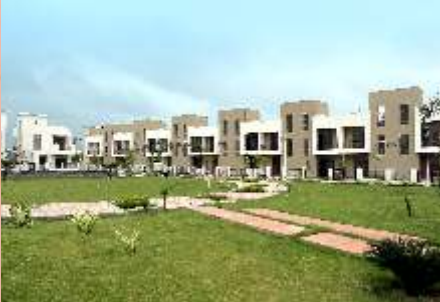
Annex Villas - Omaxe 1