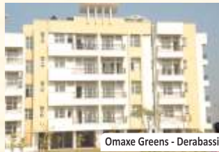
Omaxe Greens - Derabassi