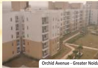
Orchid Avenue - Greater Noida