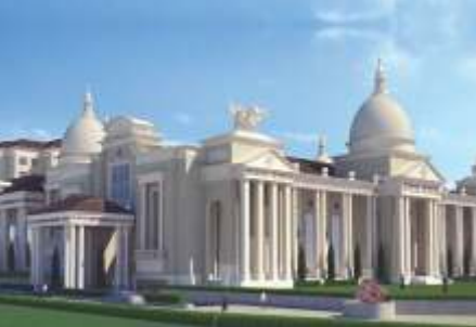
Hotel The Grand Bhagwati Omaxe 1