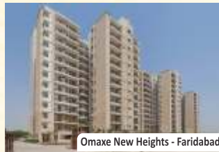
Omaxe New Heights - Faridabad