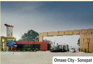
Omaxe City - Sonapat