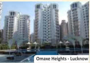
Omaxe Heights - Lucknow