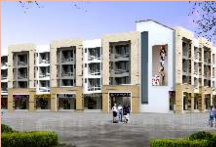
High Street Apartments Omaxe - 2

storey apartments. A pollution free environment is what is highly desirable and Omaxe Hills provides that. Besides a host of features like hospitals, shopping and entertainment mall, state-of-the-art club, school to name a few will add to the incredibility of Omaxe Hills. Accessibility to nearby cities, as well as Indore is an added advantage to own space in Omaxe Hills.