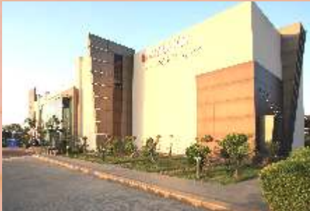
Club Heaven - Omaxe 1