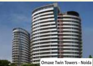
Omaxe Twin Towers - Noida