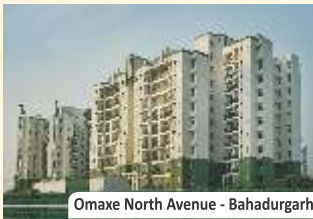
Omaxe North Avenue - Bahadurgarh