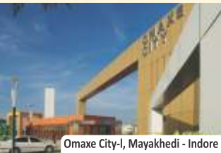
Omaxe City-I, Mayakhedi - Indore