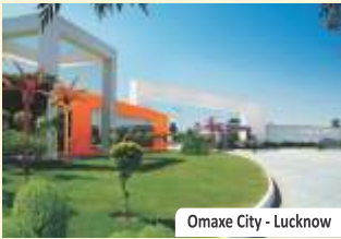
Omaxe City - Lucknow