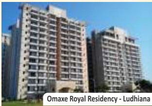
Omaxe Royal Residency - Ludhiana