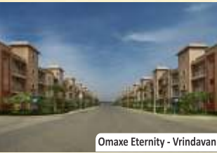
Omaxe Eternity - Vrindavan