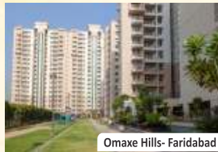
Omaxe Hills- Faridabad