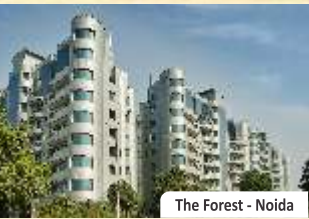
The Forest - Noida