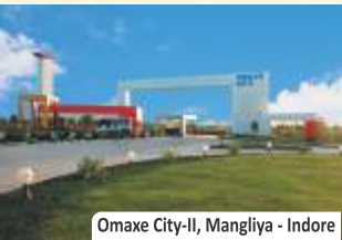
Omaxe City-II, Mangliya - Indore