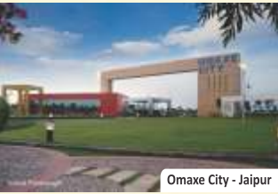
Omaxe City - Jaipur