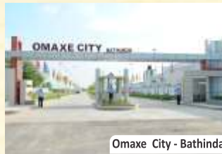
Omaxe City - Bathinda