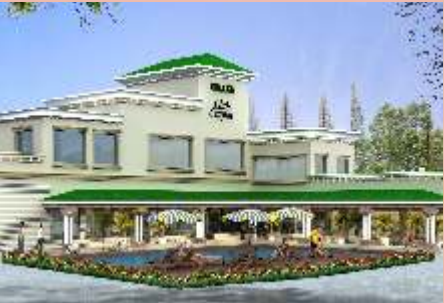
Club Canyon - Omaxe Hills