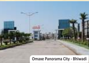
Omaxe Panorama City - Bhiwadi