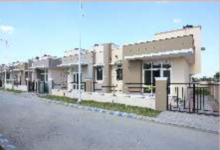
Elegant Villas - Omaxe 2