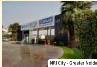
NRI City - Greater Noida