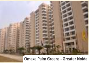
Omaxe Palm Greens - Greater Noida