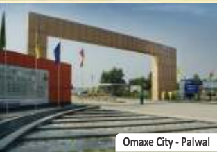
Omaxe City - Palwal