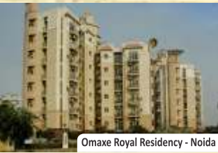
Omaxe Royal Residency - Noida