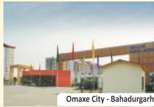
Omaxe City - Bahadurgarh