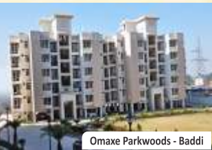
Omaxe Parkwoods - Baddi