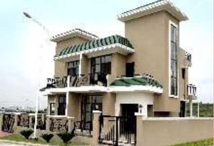
Duplex - Omaxe 2