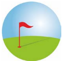
Golf Putting Greens Area