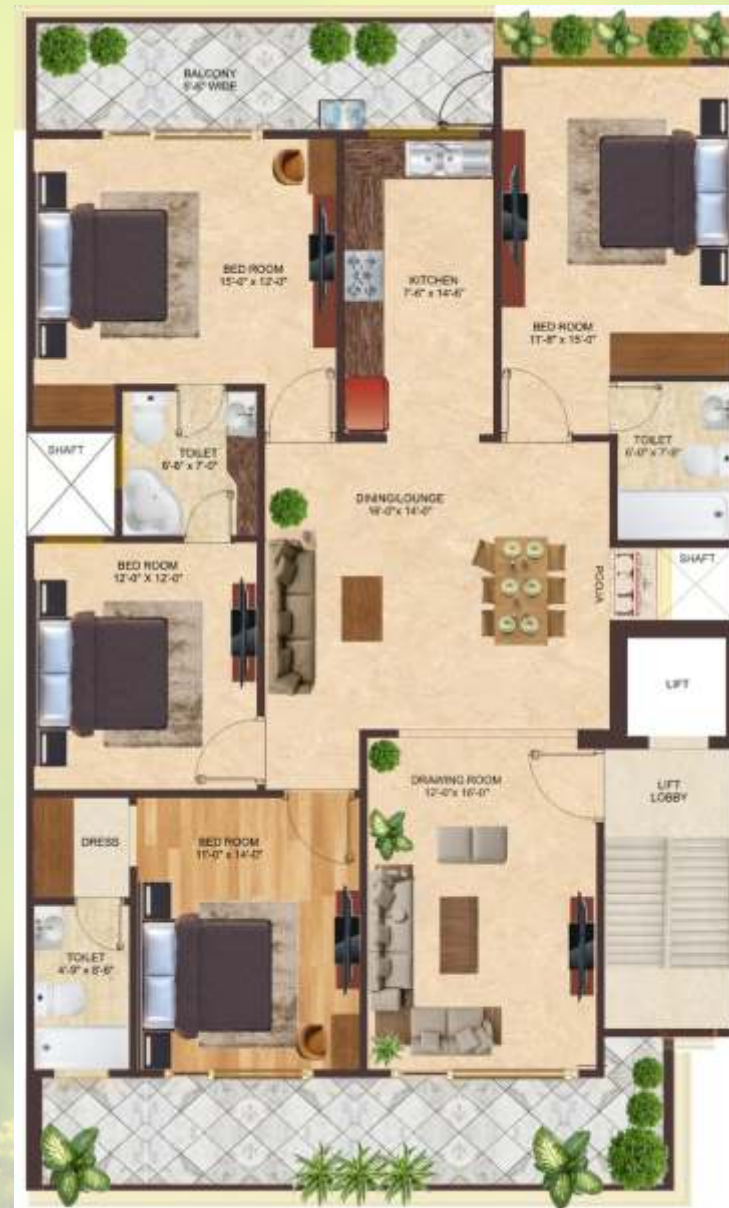
FLOOR PLAN LAYOUT