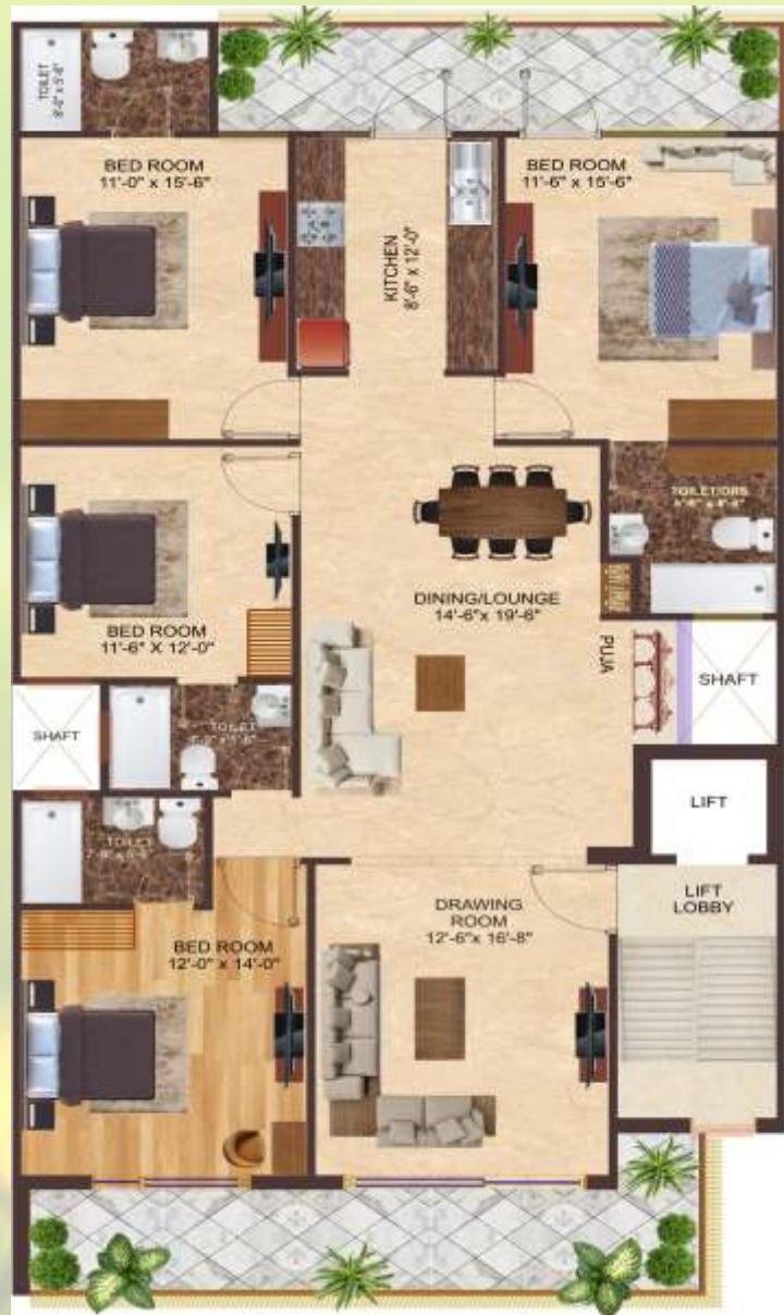
FLOOR PLAN LAYOUT