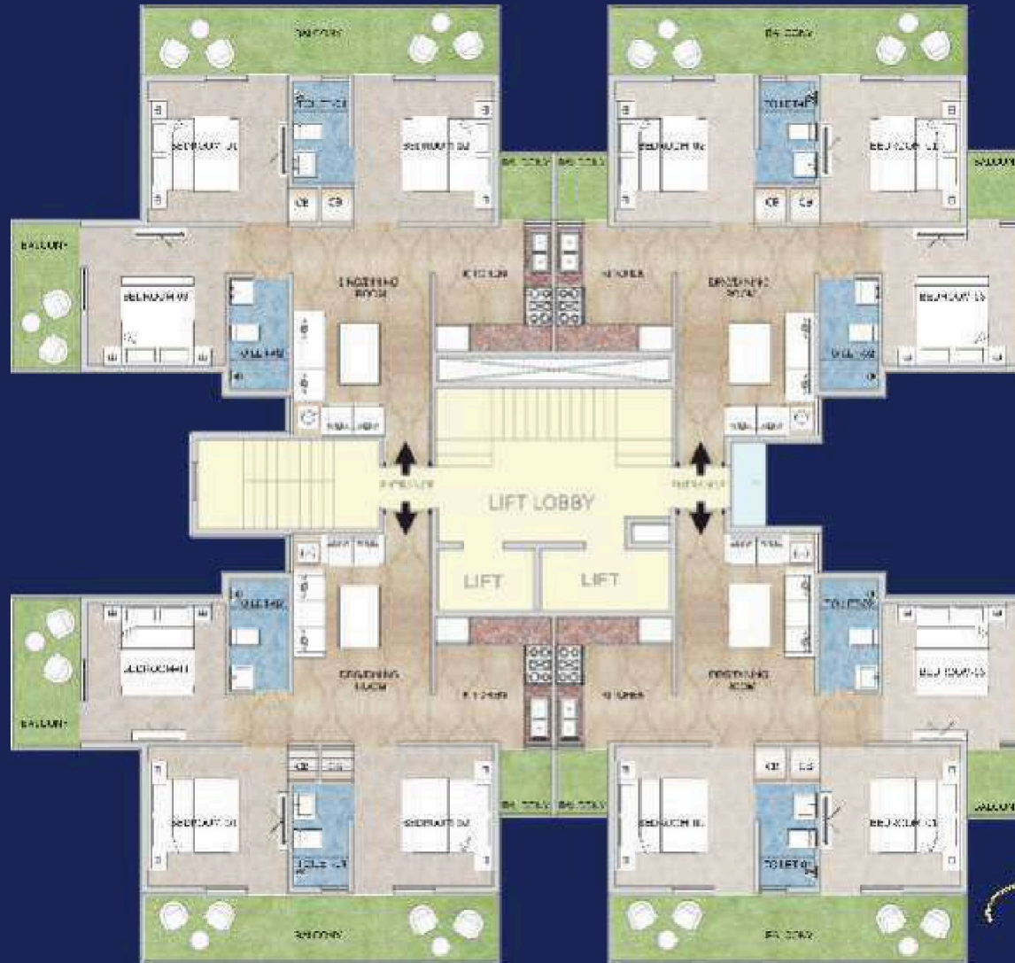
Unit Cluster plan