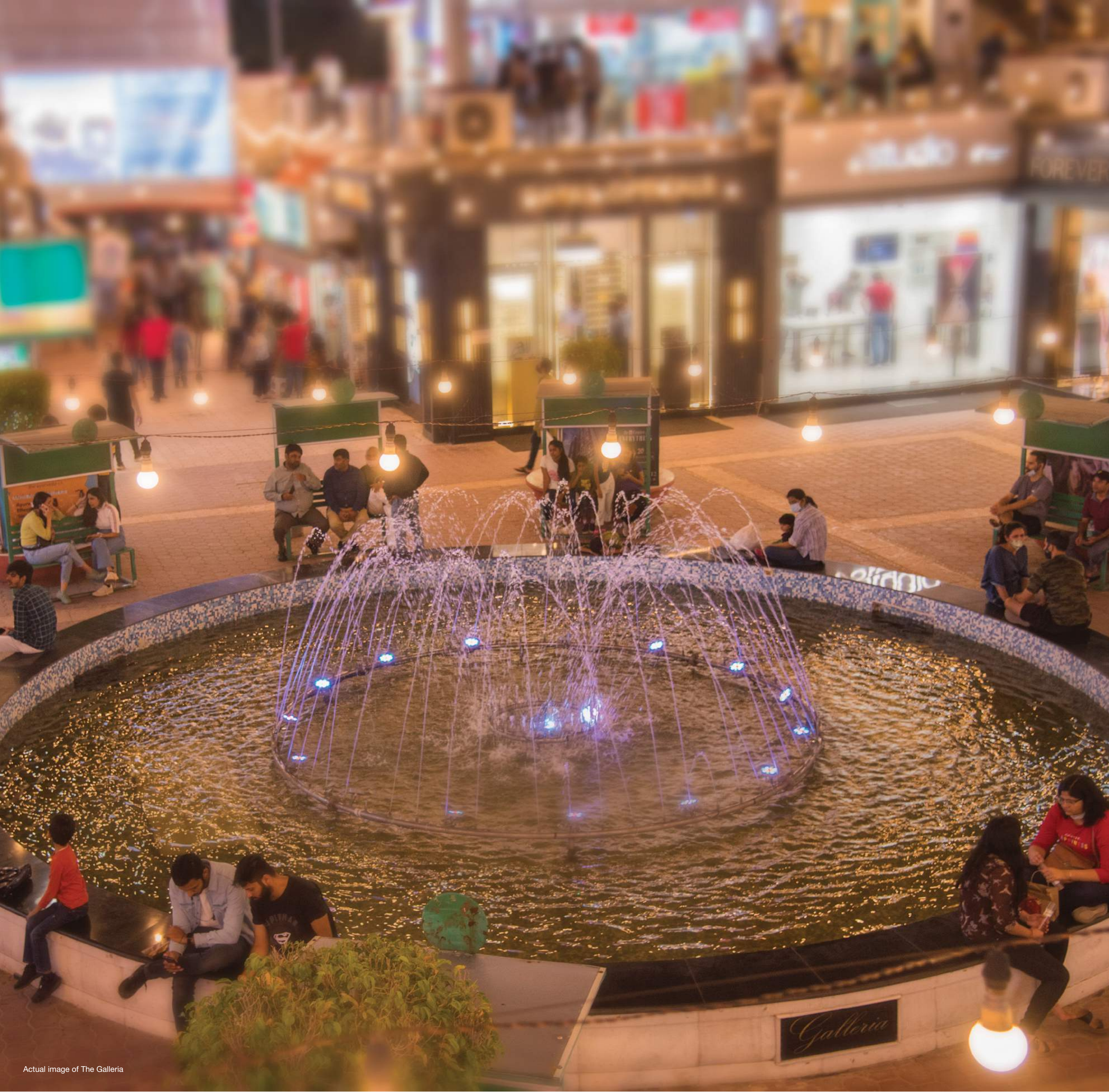
Actual image of The Galleria