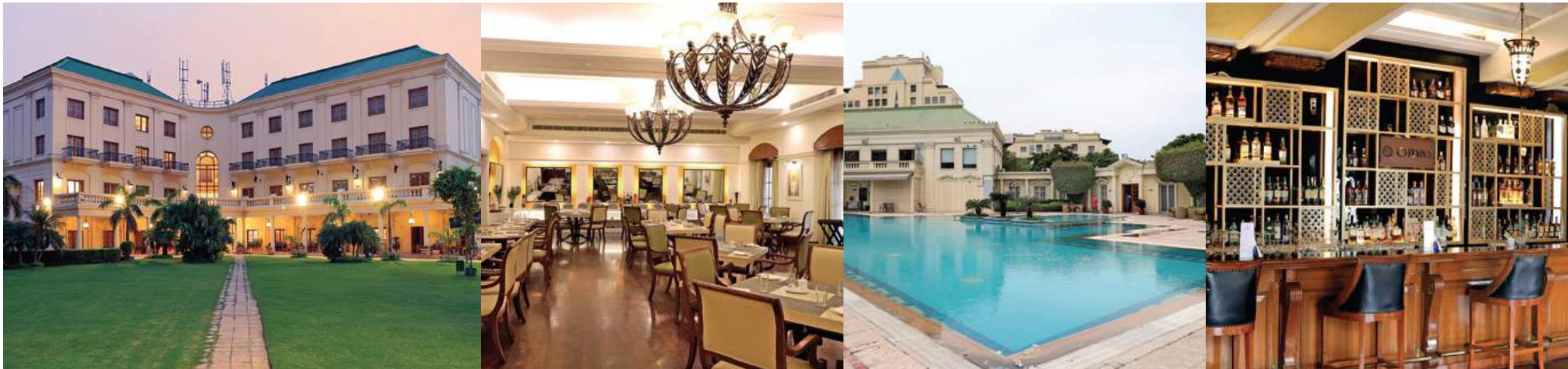
Actual images of DLF Club4

Take a leisurely dip in the swimming pool or challenge your friends to a game of tennis or burn some calories in the world-class gym. Relish various gourmet experiences with your family at the restaurant or celebrate with friends in the air-conditioned ballroom and party lawns. For those who seek the privacy of independent floor living, DLF Club4 offers the perfect balance with access to the benefits of community living close to home.