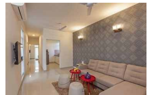
Actual Sample Images