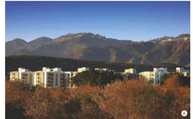
1 HERITAGE MAX - GURUGRAM | 2 INFINITI BAY - GOA | 3 OCEAN DECK - GOA | 4 CALEM GROVE 3 - GOA | 5 HERITAGE ONE - GURUGRAM | 6 ARBOREA - DEHRADUN