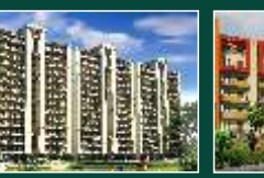
ESPANIA ROYALE HEIGHTS