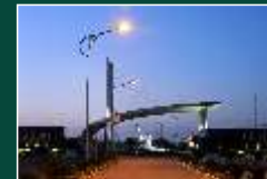
TDI CITY, PANIPAT