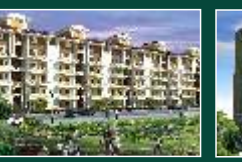
ESPANIA ROYALE FLOOR