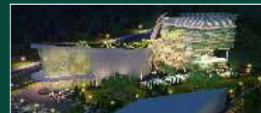
CLUB GINGER, PANIPAT