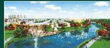
LAKE GROVE, KUNDLI