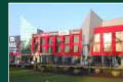
TDI MALL, KUNDLI