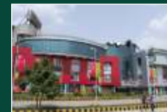
TDI MALL, RAJOURI GARDEN