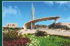
TDI CITY KUNDLI