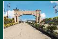
TDI TUSCAN CITY