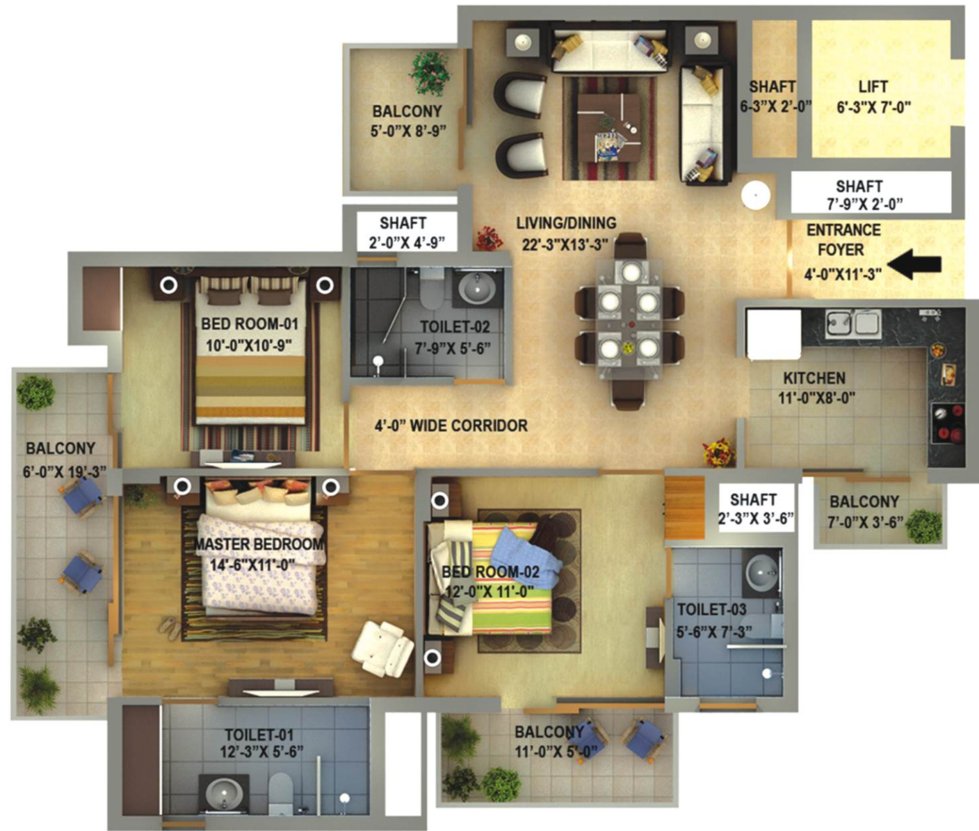
3 BHK TYPE - 1 (2D) UNIT SALE AREA = 1725.00 SQ.FT.