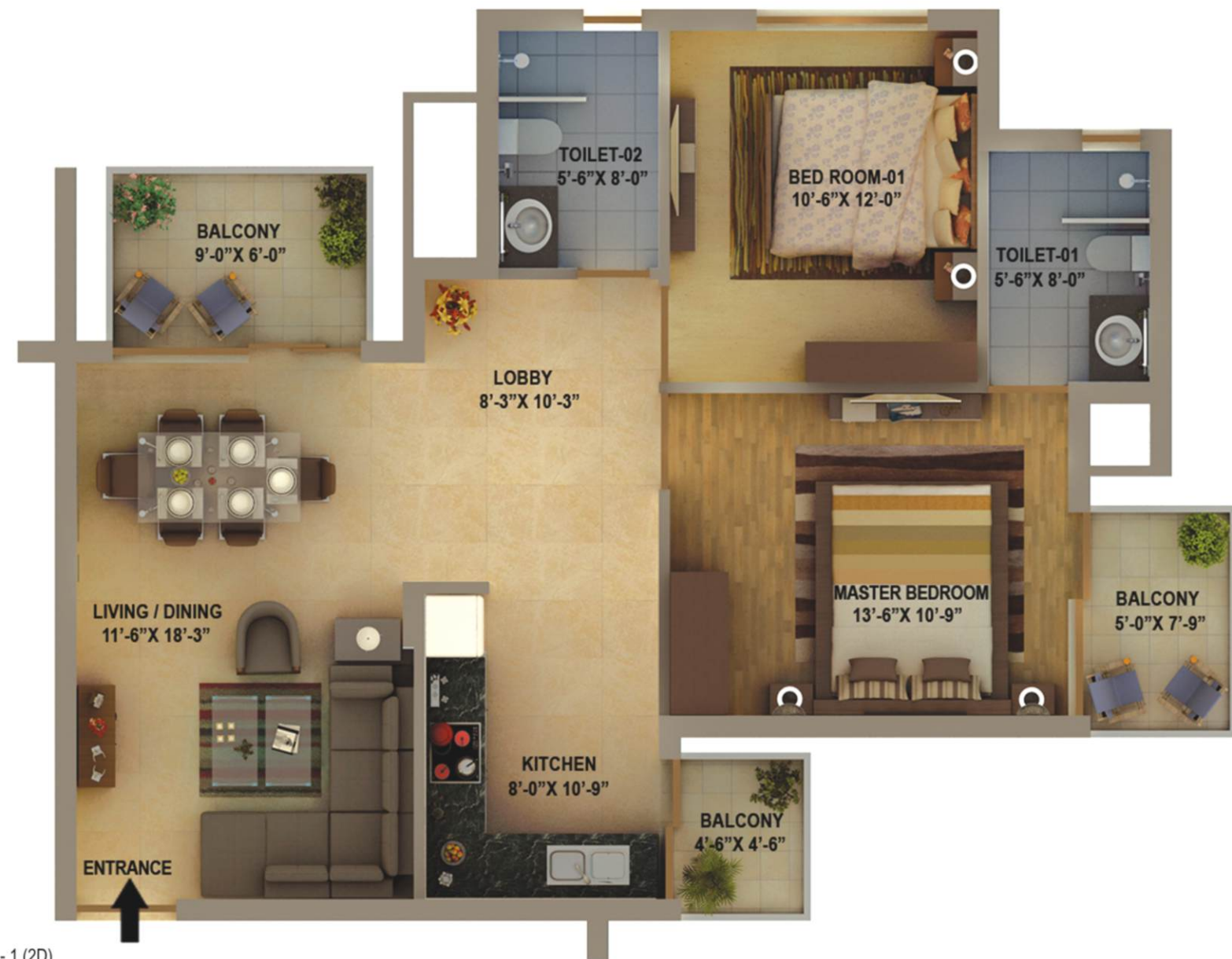
2 BHK TYPE - 1 (2D) UNIT SALE AREA = 1255.00 SQ.FT.