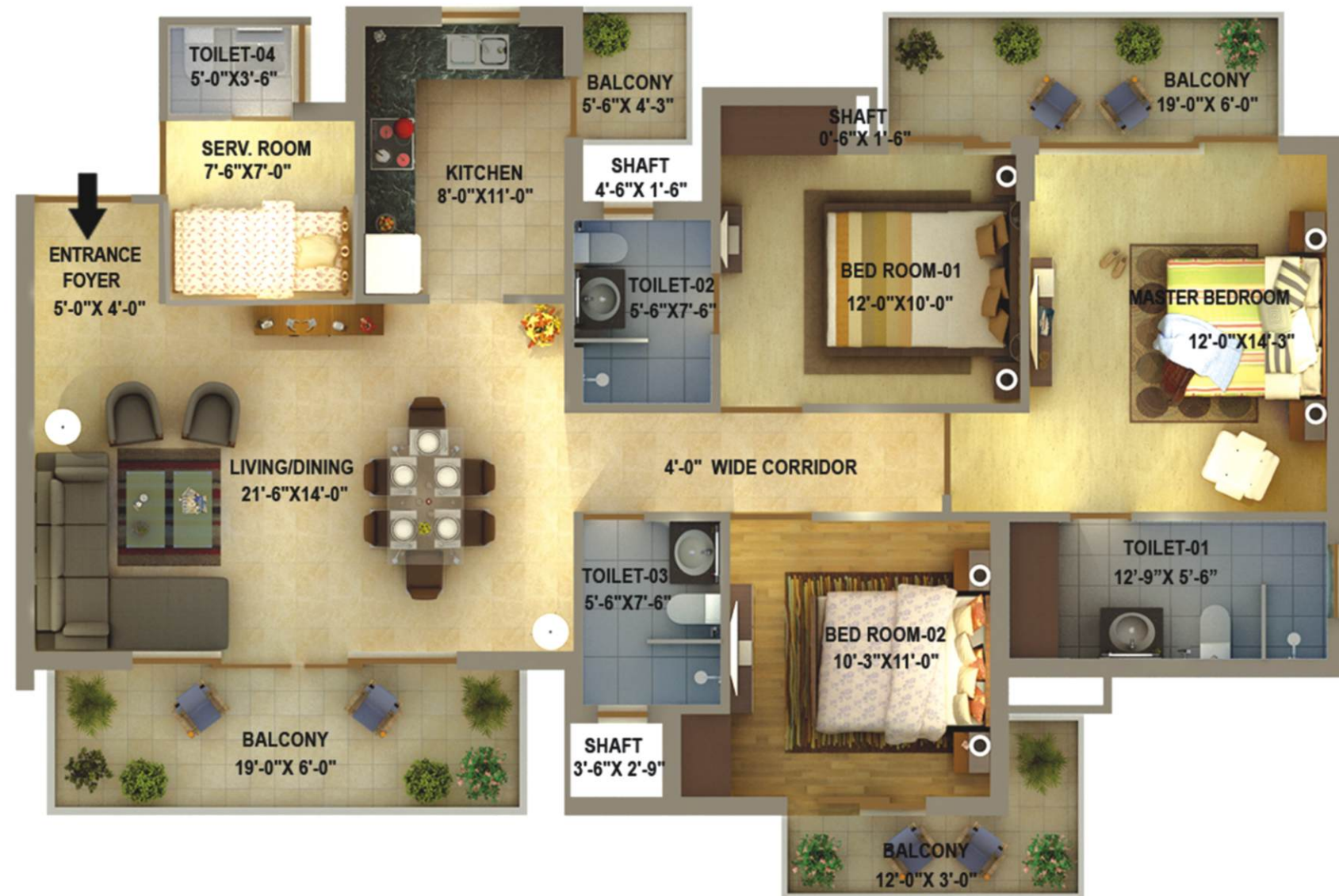
3 BHK TYPE - 1 + SERVANT ROOM (2D) UNIT SALE AREA = 1945.00 SQ.FT.