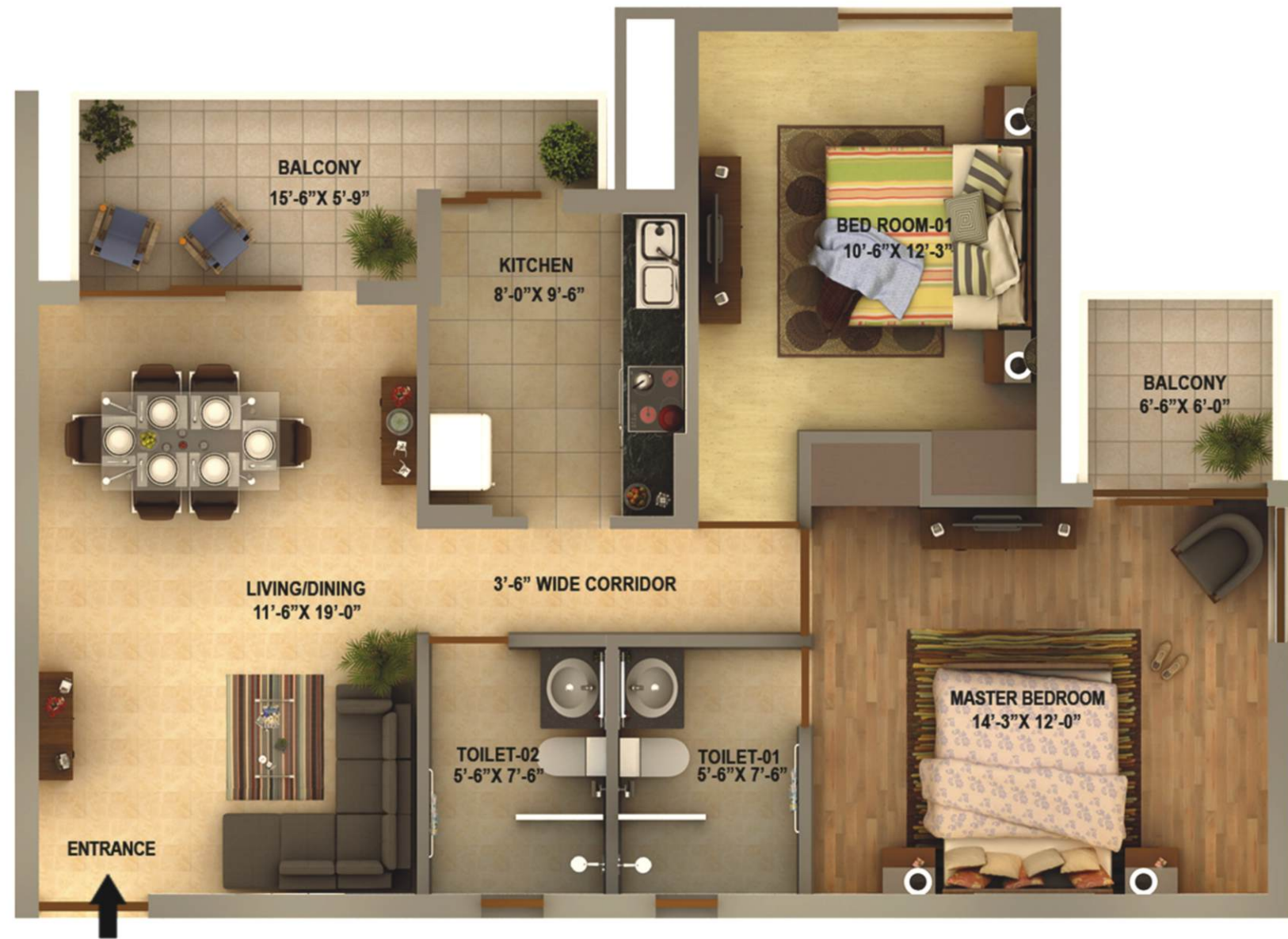
2 BHK TYPE - 2 (2D) UNIT SALE AREA = 1245.00 SQ.FT.