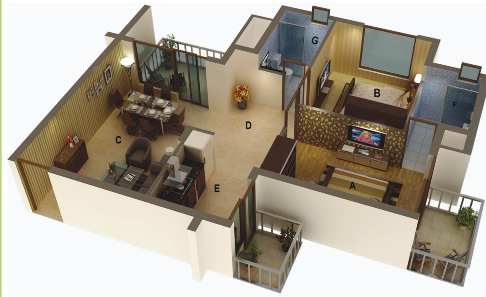
2 BHK TYPE - 1 (3D) UNIT SALE AREA = 1255.00 SQ.FT.

Note : All floor plans, layout plans, elevation and specifications are indicative and are subject to change as per Architect's decision without prior information. In order to provide reasonable architectural variations in the scheme, the architectural features may differ in different flats.