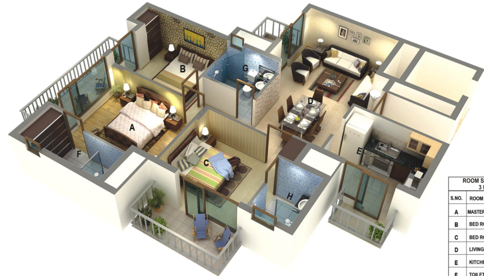
3 BHK TYPE - 1 (3D) UNIT SALE AREA = 1725.00 SQ.FT.

Note : All floor plans, layout plans, elevation and specifications are indicative and are subject to change as per Architect's decision without prior information. In order to provide reasonable architectural variations in the scheme, the architectural features may differ in different flats.