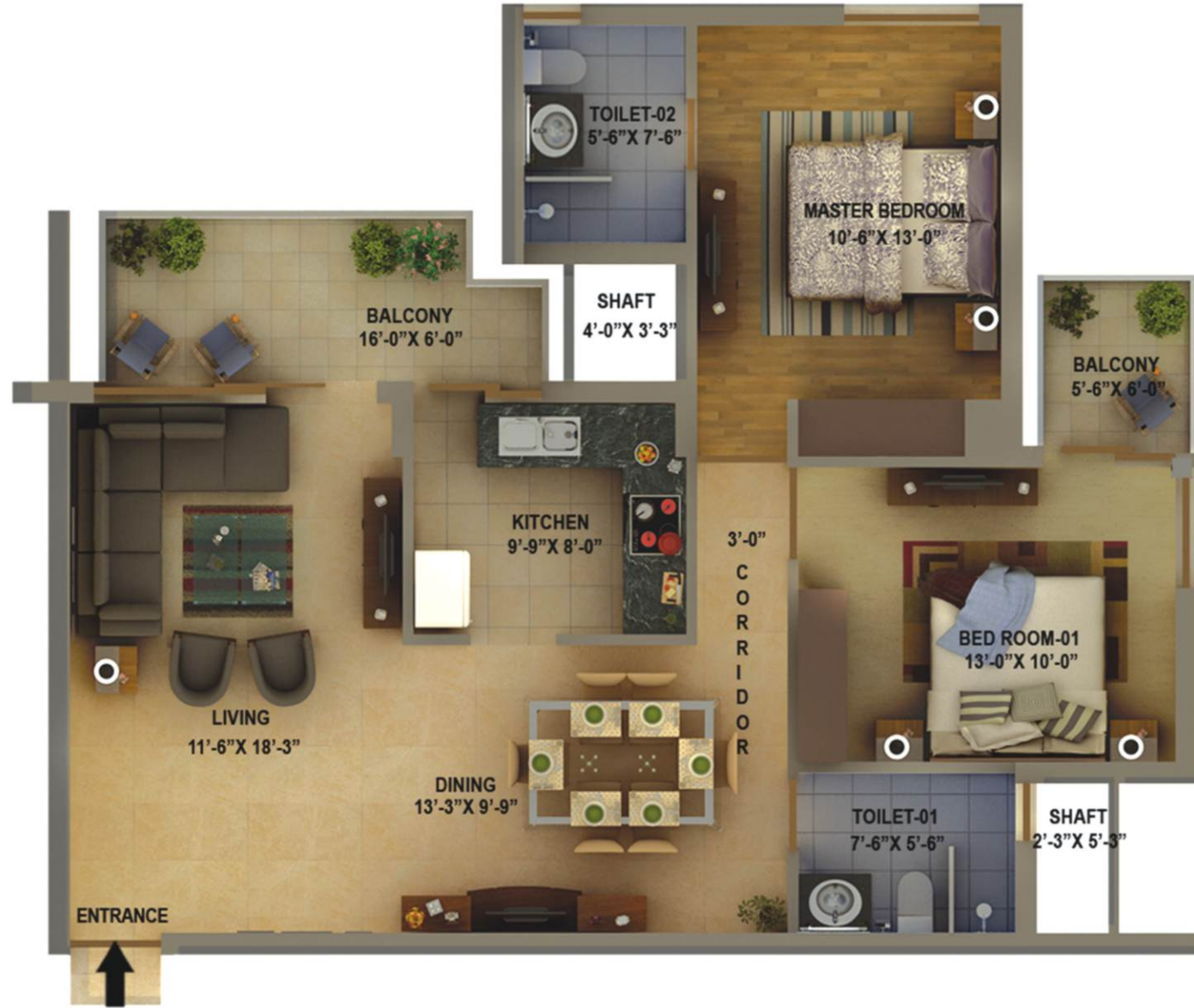
2 BHK TYPE - 3 (2D) UNIT SALE AREA = 1330.00 SQ.FT.