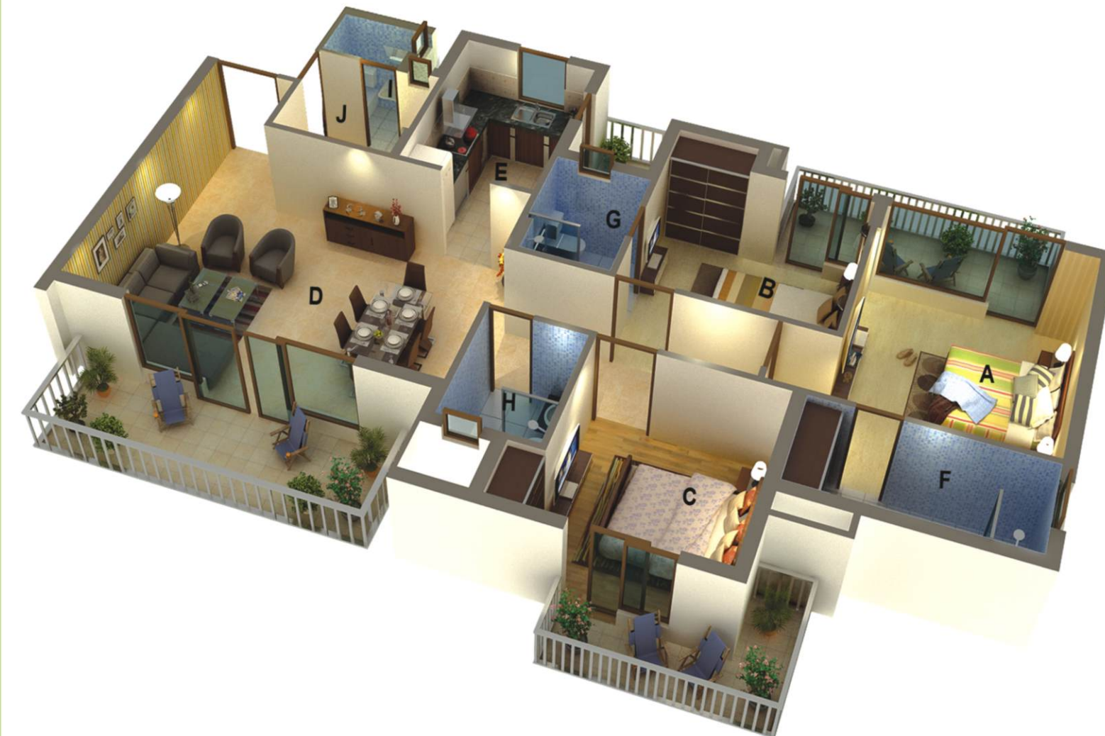
3 BHK TYPE - 1 + SERVANT ROOM (3D) UNIT SALE AREA = 1945.00 SQ.FT.

Note : All floor plans, layout plans, elevation and specifications are indicative and are subject to change as per Architect's decision without prior information. In order to provide reasonable architectural variations in the scheme, the architectural features may differ in different flats.