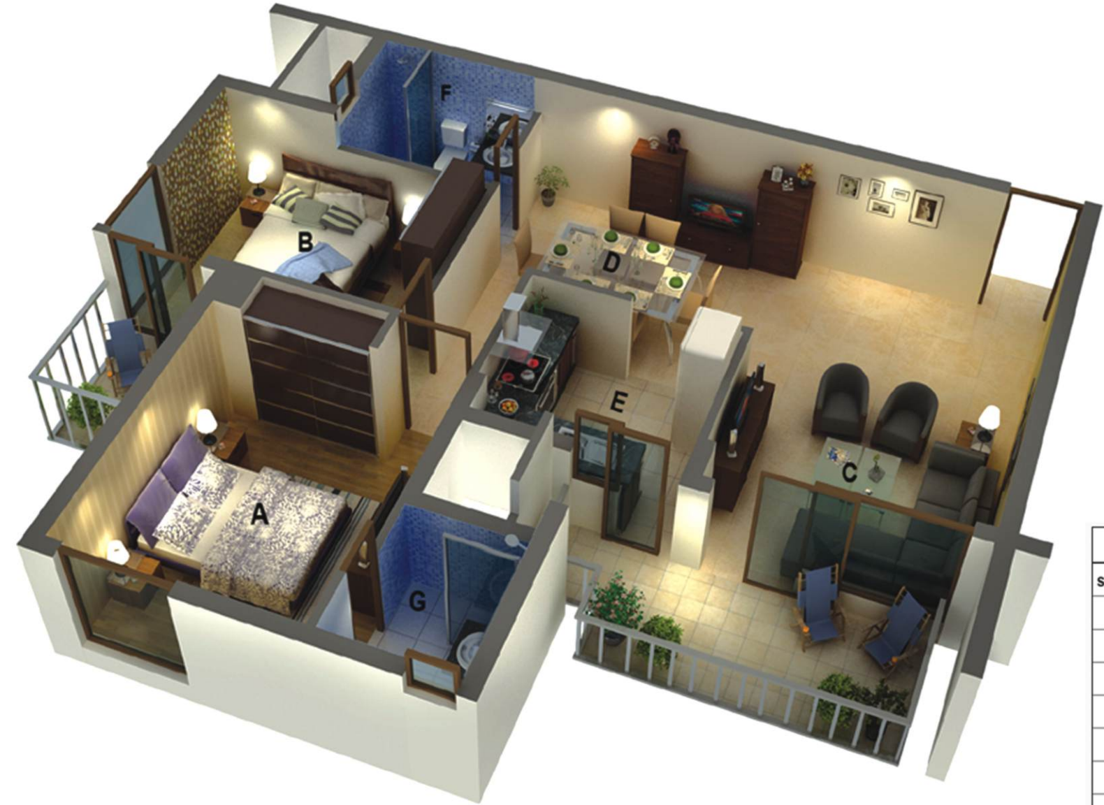
2 BHK TYPE - 3 (3D) UNIT SALE AREA = 1330.00 SQ.FT.

Note : All floor plans, layout plans, elevation and specifications are indicative and are subject to change as per Architect's decision without prior information. In order to provide reasonable architectural variations in the scheme, the architectural features may differ in different flats.