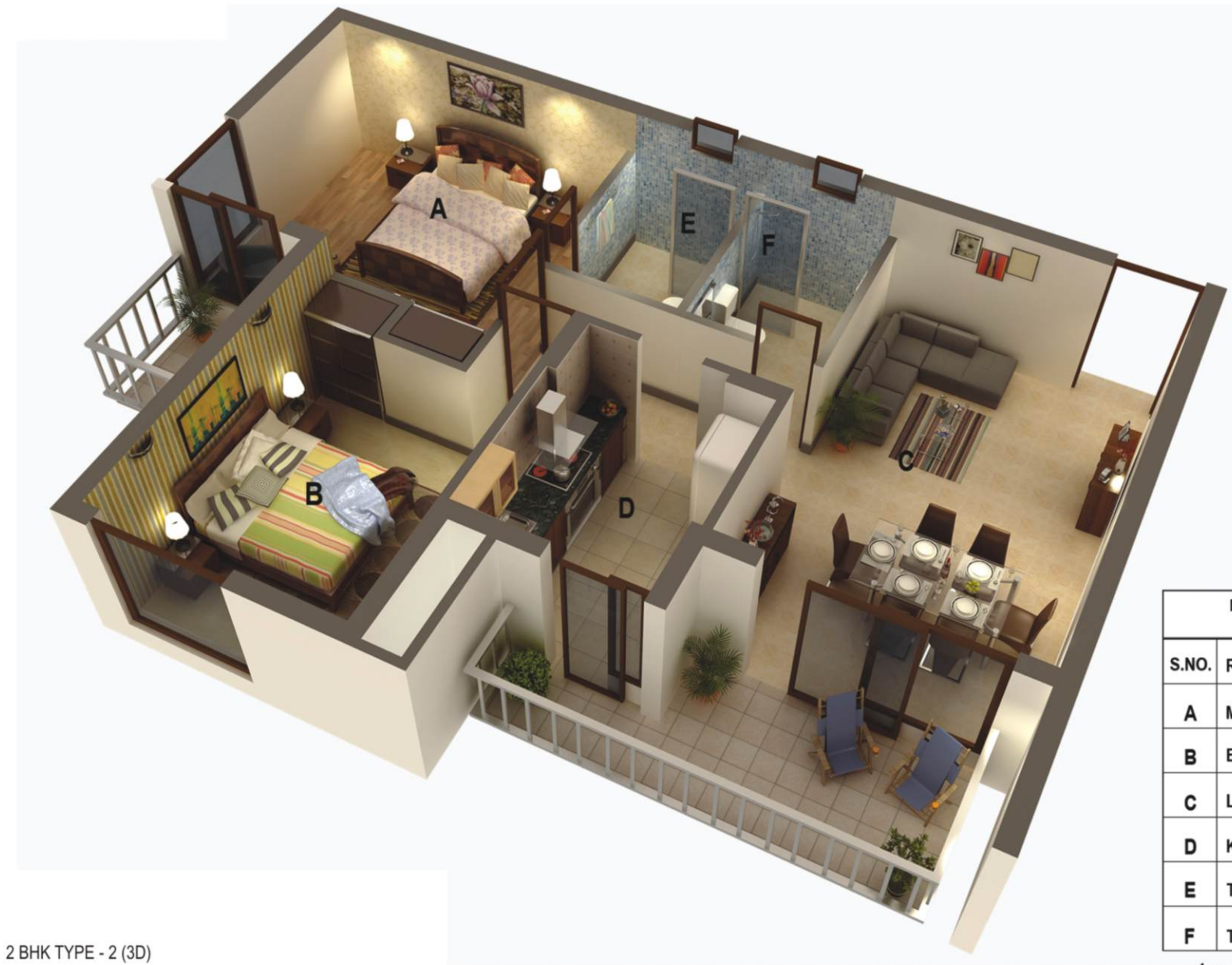
2 BHK TYPE - 2 (3D) UNIT SALE AREA = 1245.00 SQ.FT.

Note : All floor plans, layout plans, elevation and specifications are indicative and are subject to change as per Architect's decision without prior information. In order to provide reasonable architectural variations in the scheme, the architectural features may differ in different flats.